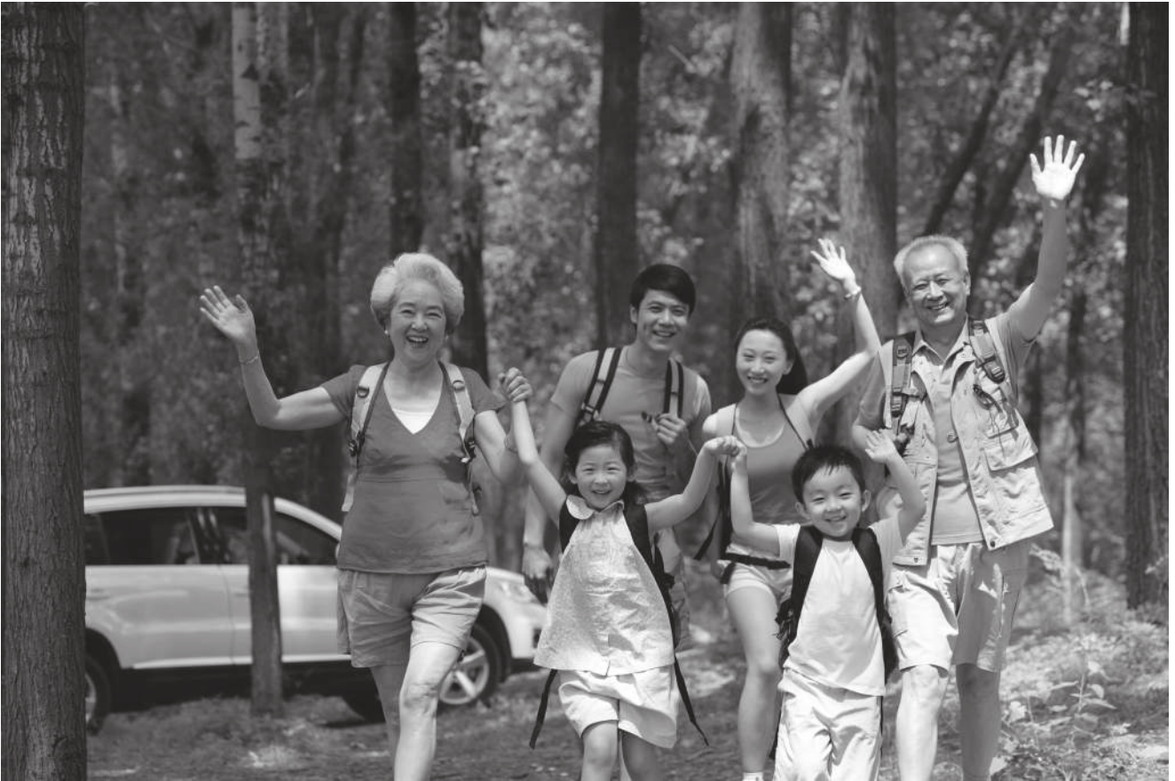
Photograph: Family on a trip out in the country